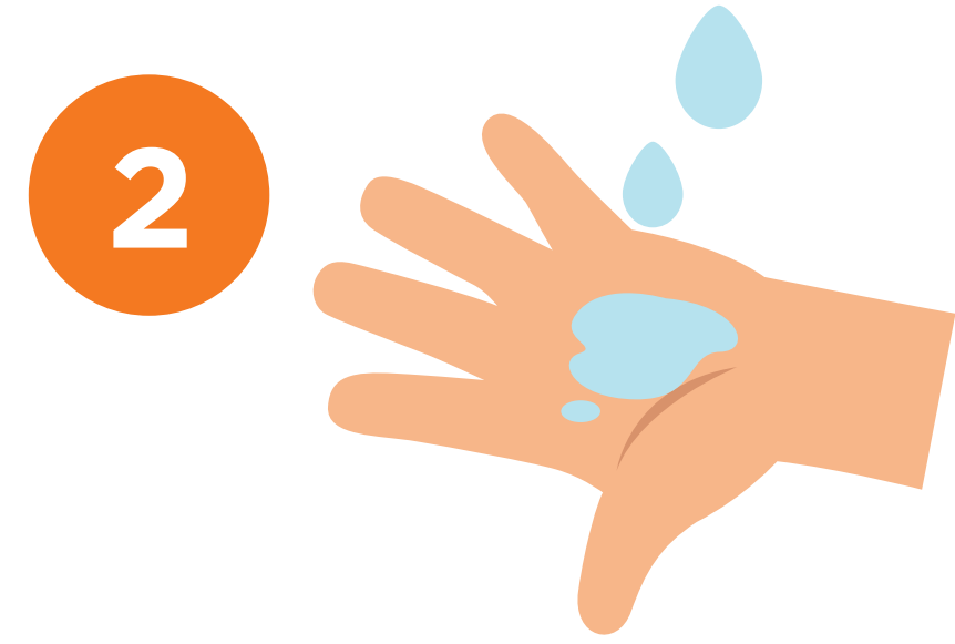
2 Apply Soap (Enjabonar)