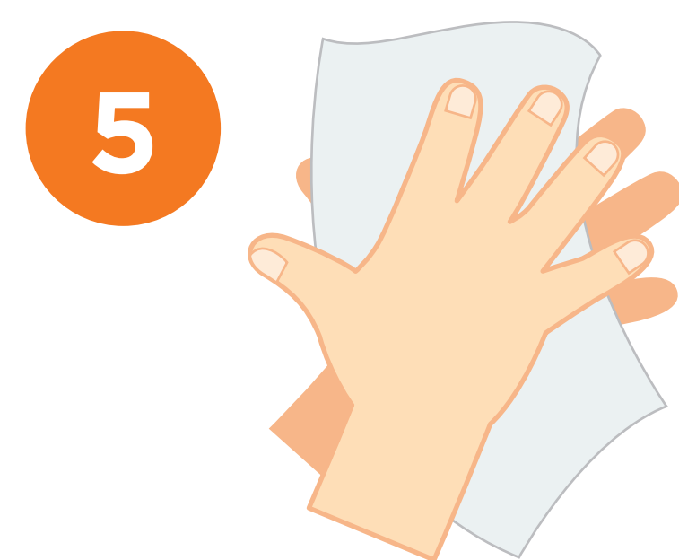
5 Dry with Paper Towel (Secar)