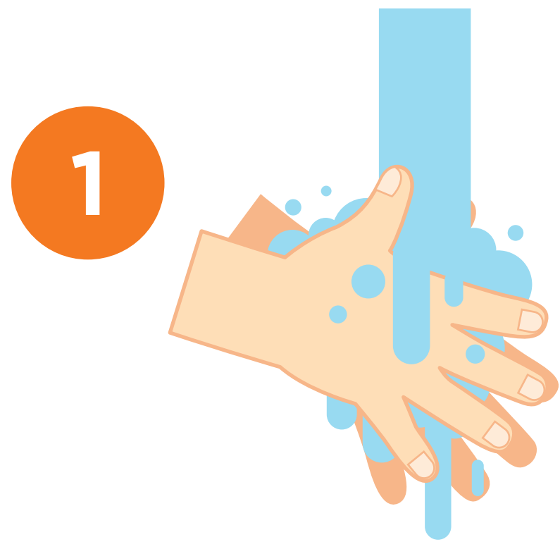
1 Wet/Pre-rinse (Mojar)