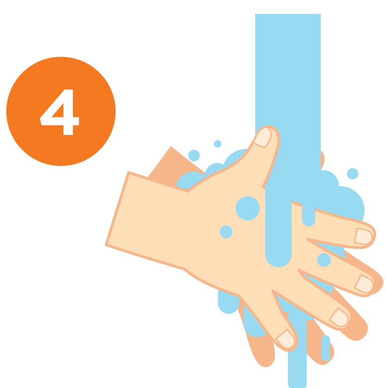
4 Rinse Hands Thoroughly (Enjuagar)